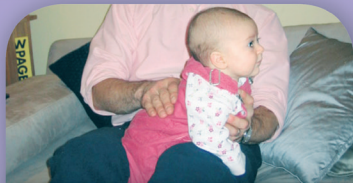
Look how far I can see...