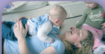
We can all have fun on the floor...