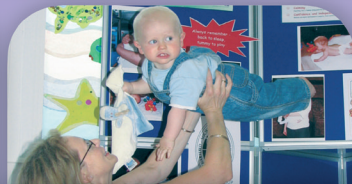
Look how strong I am now