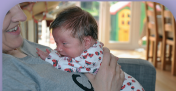
We love our cuddle time