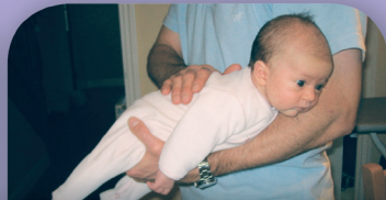
Flying starts young